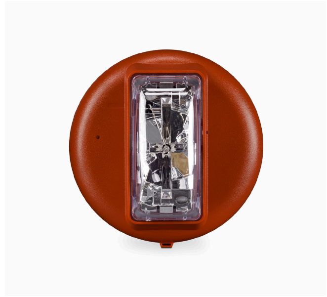
Figure 1: Indoor ceiling mount strobe