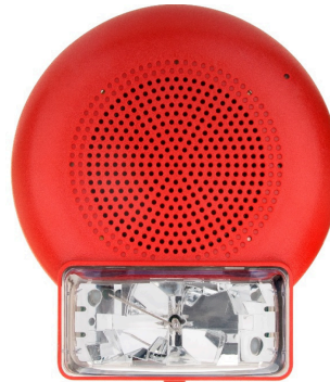
Figure 1: TrueAlert ES addressable A/V