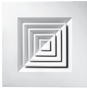
M Series LT Margin