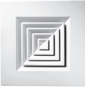
M Series LT Margin