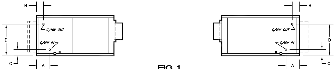
FIG. 1 RIGHT HAND HEATING OR COOLING ONLY LEFT HAND