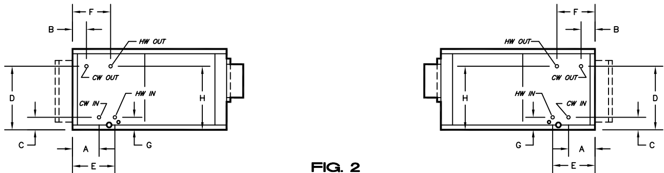
FIG. 2 RIGHT HAND HEATING + COOLING HW COIL IN RE-HEAT POSITION LEFT HAND